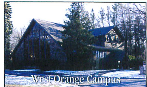
West Orange Campus