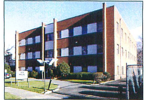
The Harambee Community Development Initiative, Inc., located in East Orange, brings together a number of Elmwood United's ministries, which impact the wider community. Harambee means "all pull together" in Swahili.

If you would like to make an investment in support of Elmwood United Presbyterian Church to help further reduce the cost of our loan, please contact the Investment & Loan Program at 800-903-7457, Ext. 5865.