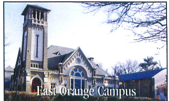
East Orange Campus